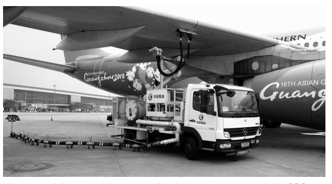
We successfully ensured the supply of jet fuel to our customers in the PRC during the Shanghai World Expo and Guangzhou Asian Games