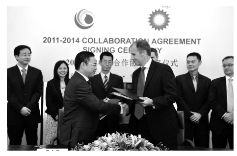
CAO was awarded Most Transparent Company (Runner-Up in the Foreign Category) of SIAS Investors Choice Award 2010

CAO signed the 2011-2014 Collaboration Agreement with BP on 12 October 2010. Not only does this business collaboration provide CAO with access to new markets such as the Middle East and Europe, it also increases our trading volume, extends our geographical reach and significantly strengthens our trading capabilities.