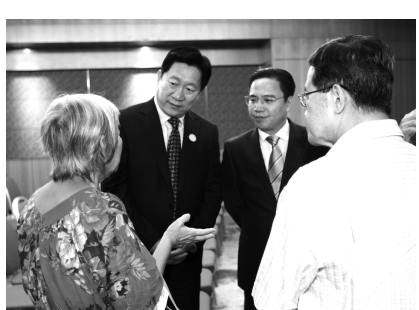
Interaction with shareholders after the EGM in December 2010