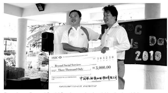
Donation to Beyond Social Services to fund activities for the children

Whilst CAO achieved good performance in 2010, we were confronted with two main challenges: (i) lack of substantial progress in assets investment; and (ii) jet fuel remains as the single core business of CAO. In essence, CAO has yet to fully diversify its business and transform into an integrated trading company with synergetic assets.